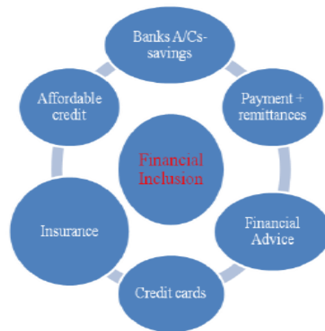
Fig: 2. Financial Inclusion

And just to help these above categories and person, rural banks are playing a vital role by introducing the concept of financial inclusion which means first understand the needs of the rural people and then support them in the best way at an affordable cost.